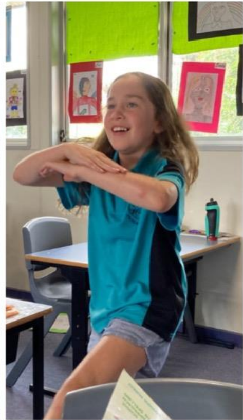
Russian Dancing during Language and Culture and a visit from Drago the water dragon.